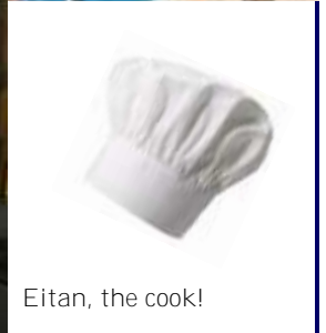
Eitan, the cook!