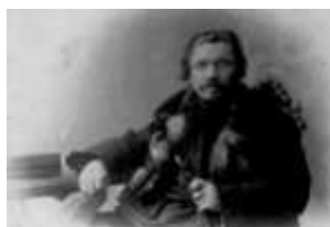
Movies—Sholem Aleichem: Laughing in the Darkness