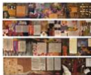
Art—Contemporary approach to Jewish scripture