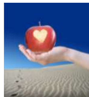
Theatre— Apples from the Desert