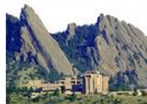
NCAR in beautiful Boulder, CO

He is with the National Center for Atmospheric Research (NCAR).